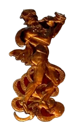
Two of magnificent Art Deco figures that still adorn the auditorium