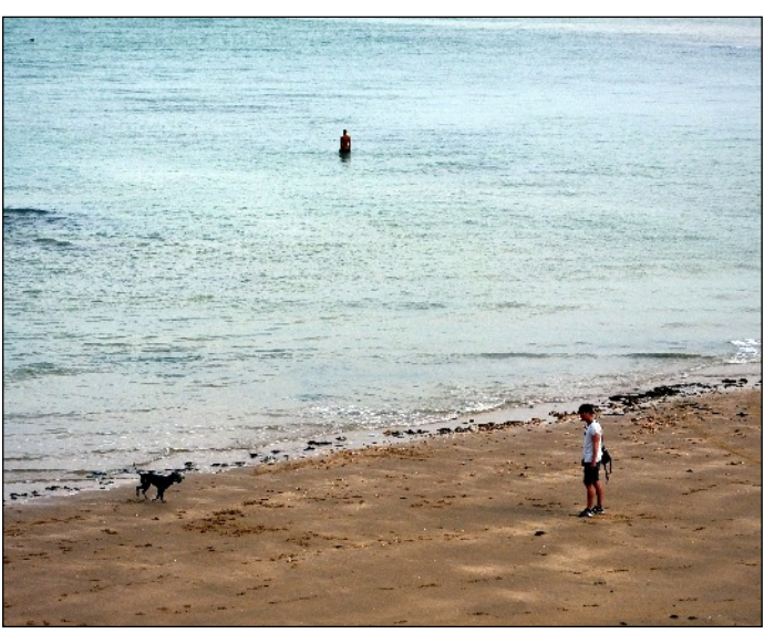
The Gormley figure seen from the promenade at the rear of Turner Contemporary. The boy with his dog indicate the distance from the shore. The tide is coming in

These two photos show the Gormley ANOTHER TIME figure at Oxford. It is located on a rooftop at the junction of Broad Street and Turl Street. It was installed in 2009