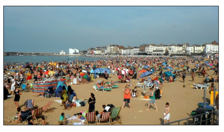
Margate Sands on August Bank Holiday this year - just like old times!

https://www.designsoutheast.org/urban-design-autumn-school-with-uca/