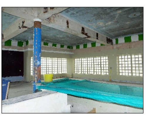
Inside the Sunshine Cafe (looking north-east)