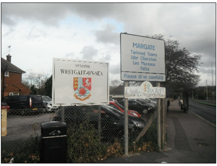
Photo taken in November 2015 showing the three signs in place at that time