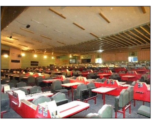
The Bingo Hall in the auditorium