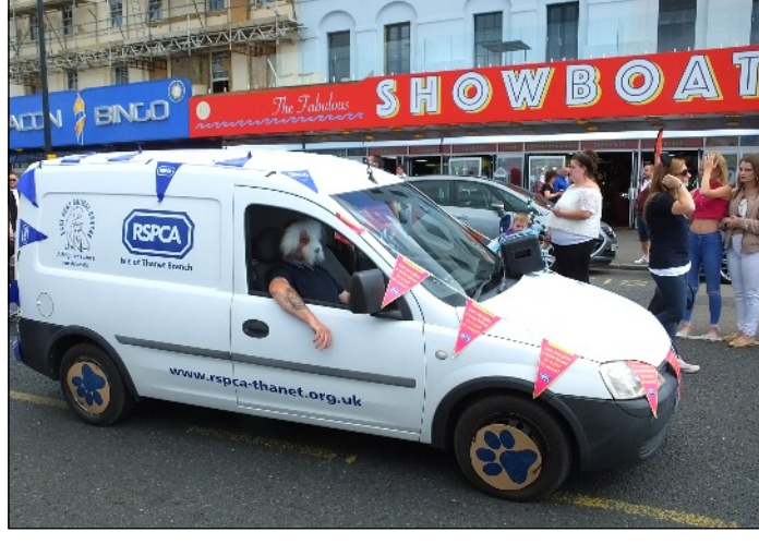
The RSPCA float was one of the more imaginative floats with the driver of the van wearing a sheep-dog mask

The weather was very good and the carnival certainly attracted a large number of spectators. Without doubt, a lot of work had gone organising the carnival but, for me, the carnival was a shadow of the Margate Carnival of some half a century ago when perhaps as many as half-a-dozen marching youth bands took part in the procession and many public service undertakings entered very imaginative floats. Who could ever forget watching the hugely impressive USAAF marching band from Manston Aerodrome playing When The Saints Go Marching In with their unique display of about-turn marching as the procession passed or the year when grown men from a local Round Table club performed magnificently as majorettes to the public's great amusement? Oh, they were the days and I am very pleased that I lived to see them. Certainly, the 1953 Cadillac in this year's carnival brought back many such happy memories to me.