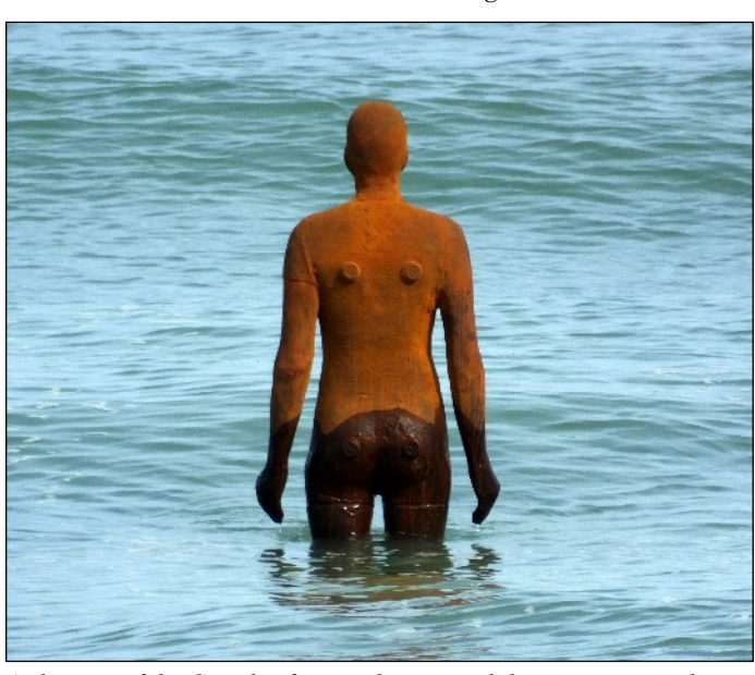
A close-up of the Gormley figure taken around the same time as the top