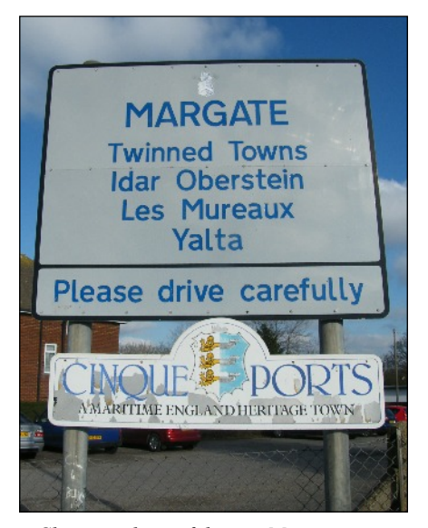
Close-up photo of the two Margate signs taken in January 2011