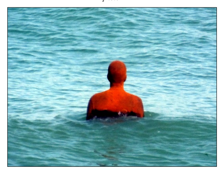
This photo was taken from the first floor gallery window at Turner Contemporary an hour or so after the two upper photos - with just the head and shoulders of the figure exposed. It would not be too long before the incoming tide completely covered the figure. At low tide, the figure is completely exposed