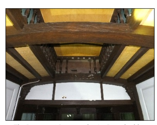
The Directors' Room in the Art Deco building took the form of Tudor galleon