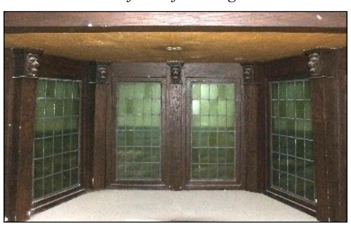
The window, complete with lion heads, in the mock-Tudor former Directors' Room