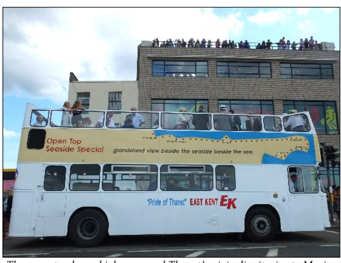
The open-top bus which conveyed Thanet's civic dignitaries to Marine Terrace to watch the carnival procession from the upper-deck as the carnival passed by