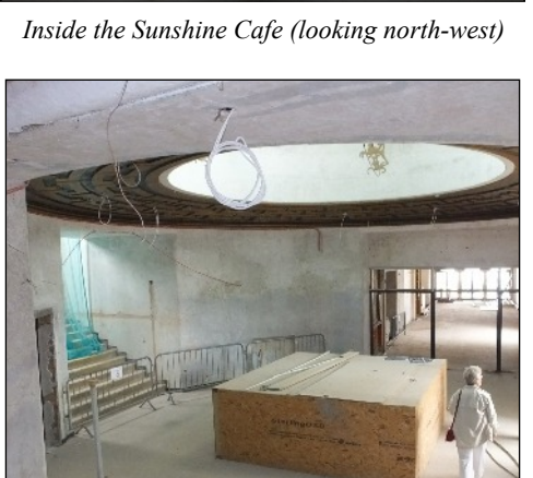
Showing the foyer and the main entrance to the cinema. Many of our members will fondly remember it as it was in its hey-day